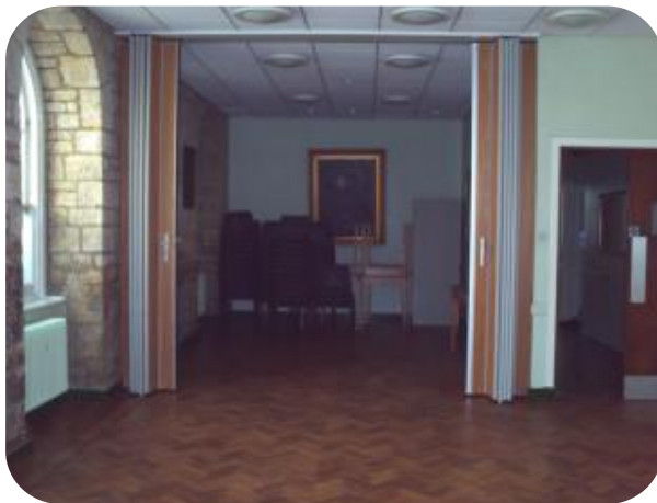
Additional area for lower hall.