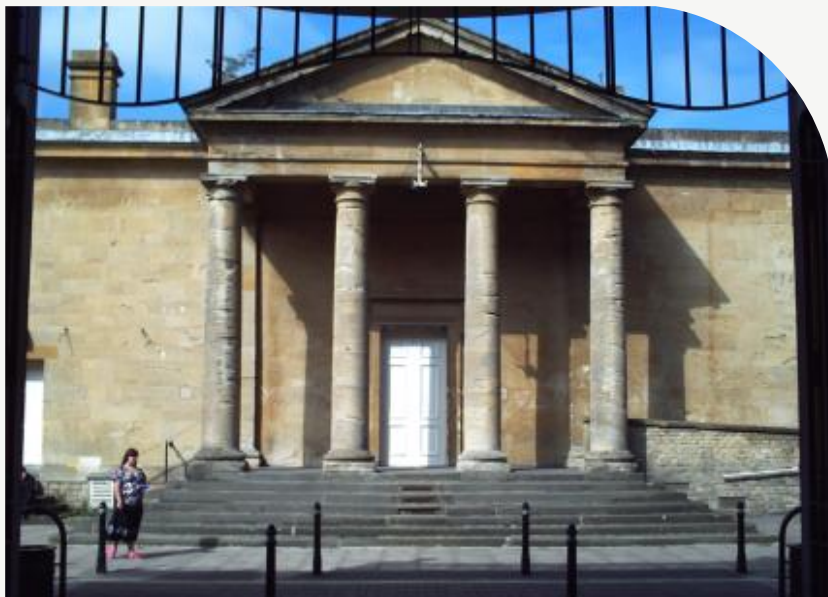
The Main entrance to the Large Hall

One of the original Market Hall pillars now stands on the lower side of the Town Hall and a Chiffonier made from the wood of the Elm tree is on display in the Museum. The New Town Hall was built on arches;