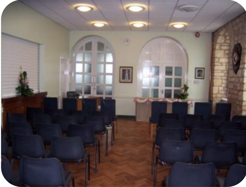
Lower Hall prepared for a naming ceremony