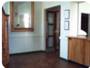
Kitchen and Lower Hall entrance.

The building is licensed for alcohol & regulated entertainment.